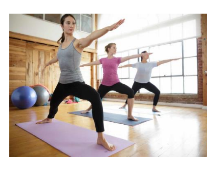
Stretch & Recovery