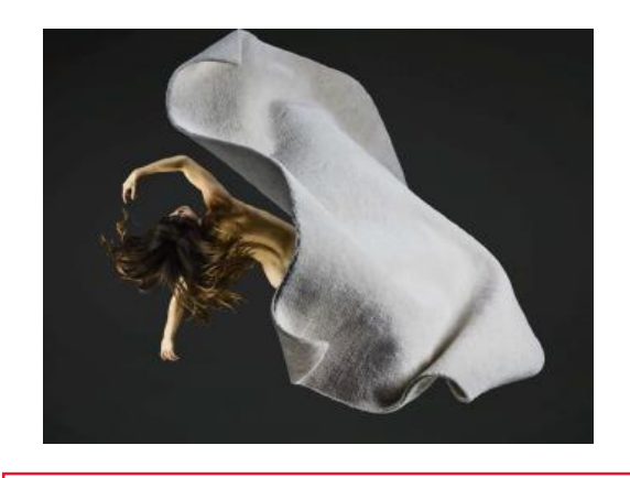
Crush resistant durability