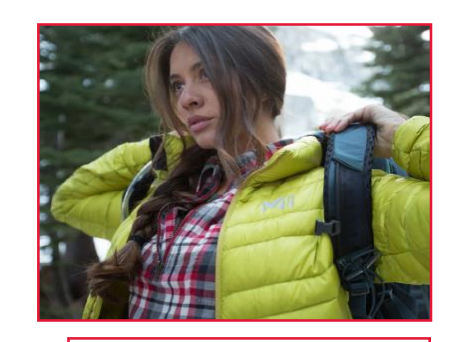
Lightweight, Breathable Warmth