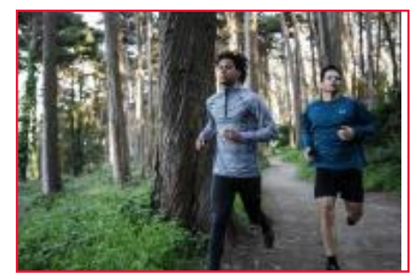
Wicking, Fast Drying