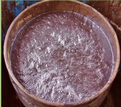
SOLID PRODUCTS AND FUEL GASES