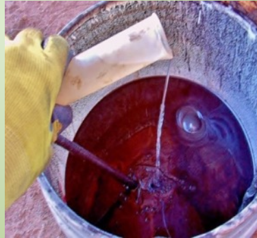
CO 2 AND WATER